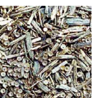
Bird's nest fungus (Crucibulum spp).