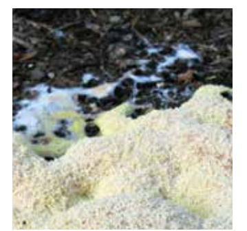
A fresh, brightly colored yellow slime mold.

What do slime molds look like? They start as brightly colored (yellow, orange, etc.), slimy masses that are several inches to more than a foot across. They produce many tiny, dark spores. These molds dry out and turn brown, eventually appearing as a white, dry, powdery mass.