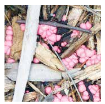
A fresh, brightly colored pink slime mold.