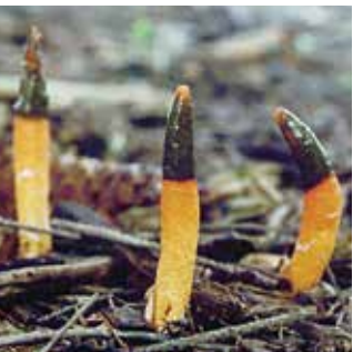
Many different species of fungi produce fruiting bodies called mushrooms.